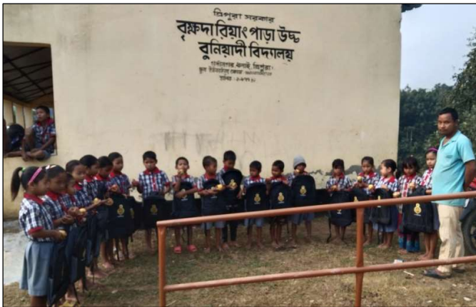
Distribution of Schools Bag