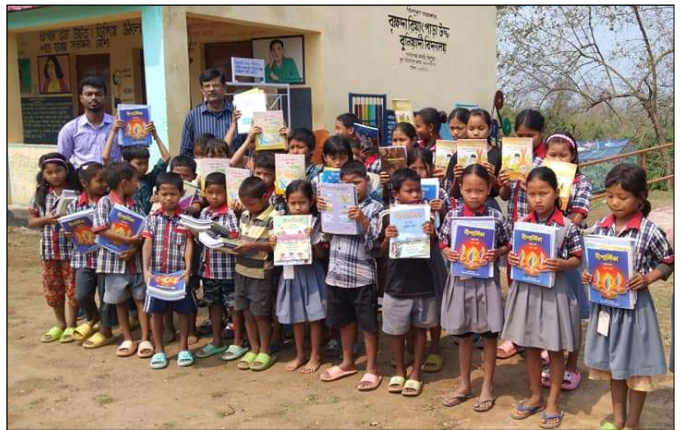
Distribution of Free Text Books