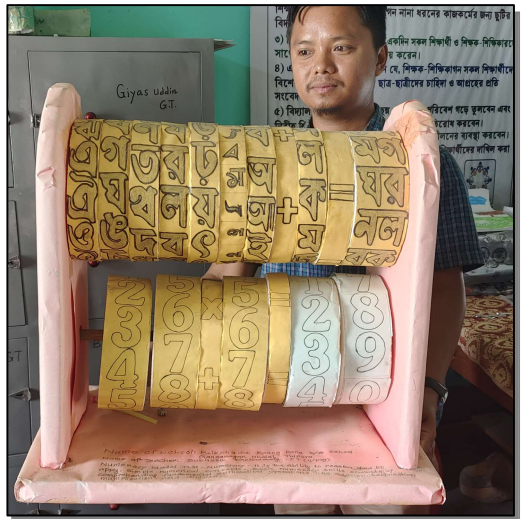
Handmade law cost TLM